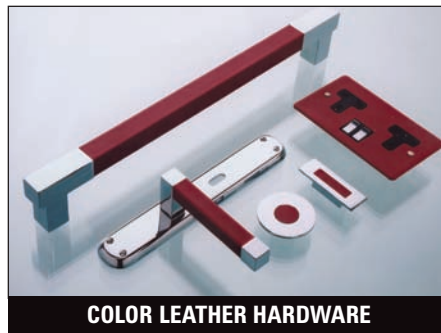
COLOR LEATHER HARDWARE

fiddle rails, the company states. Its stock collection includes more than 20 styles of door handles, door pulls, push plates, and window fittings. The manufacturer heavily considers the type of full grain, bridal leather as well as correct tanning process before producing a new piece of hardware. The new range of colors available includes Library Green, Atlantic Blue and Jazz Red. + 44 (0) 1271/325325 | www.turnstyledesigns.com